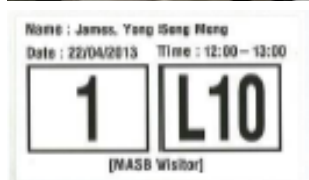
(Sticker ID badge)