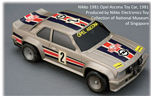
Nikko 1981 Opel Ascona Toy Car, 1981 Produced by Nikko Electronics Toy Collection of National Museum of Singapore